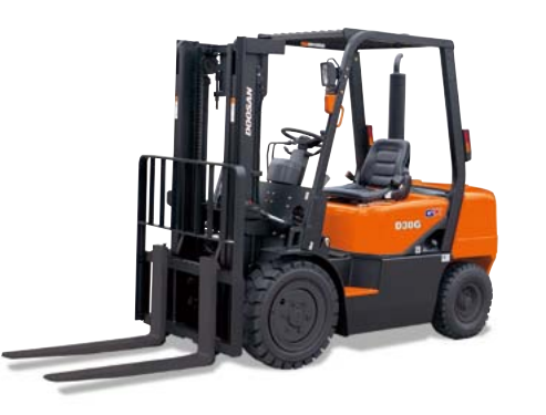
D20G / D25G / D30G 2,000kg 2,500kg 3,000kg Diesel, Pneumatic Tire